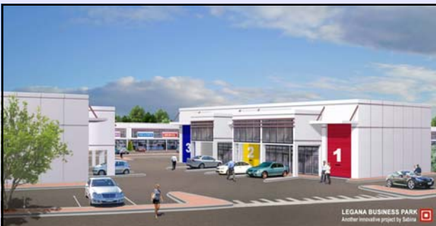
Mini Factories (Illustration only)

Master Plan - 47 allotments. Stage 1 available to buy now with settlement 30 days after issue of title.