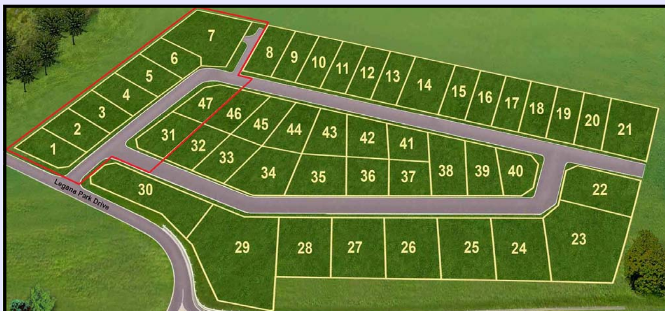
Stage 1 - Shown in Red above. Subdivision works estimated completion by mid-2010.

For full details on the West Tamar Planning Scheme visit www.wtc.tas.gov.au